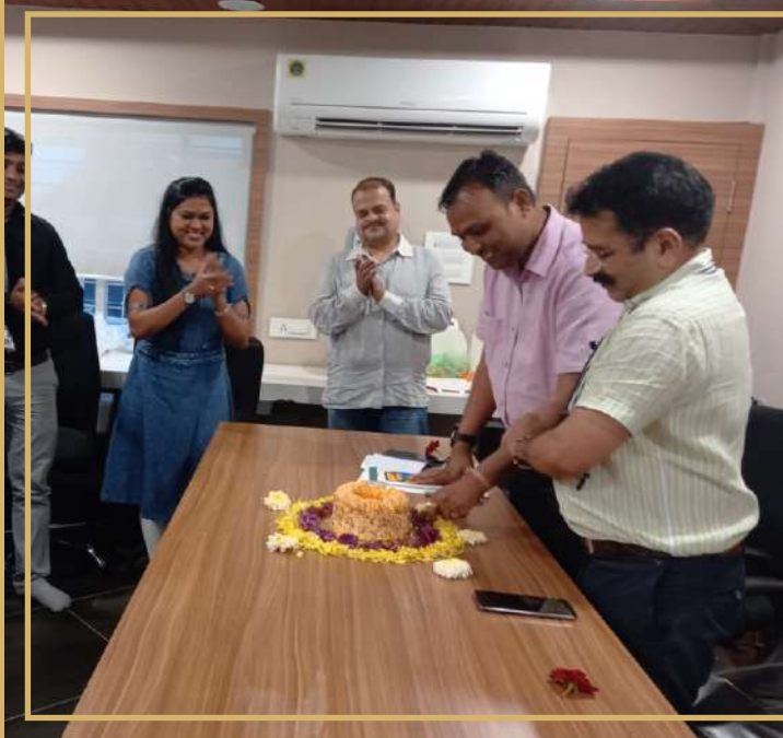
Guru Purnima Celebration at Mahalaxmi Infra.